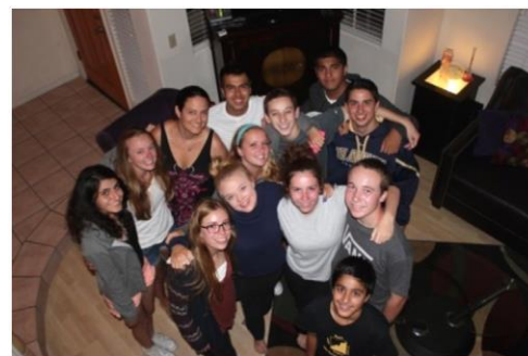
MNMS@NADE Leaders had a great time planning out their MNMS School Club Activities and MNMS Unity Day for the 2013-2014 school year.

~11,527 Books donated impacting around 4,000+ youth across the country.